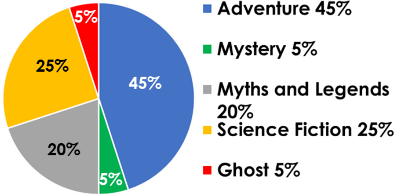
Types of Fiction

2. 120 children voted for their favourite type of TV programme. Who is correct?